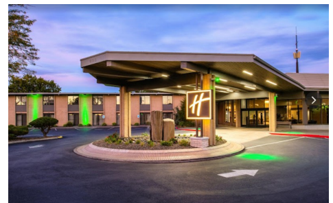
Holiday Inn, Richland WA